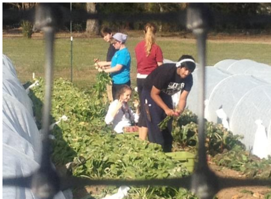
Figure 3. Students harvesting crops on Oxford Organic Farm learn about the sources of food.