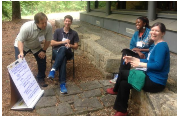
Figure 2. Small group discussions help facilitate peer learning. (Barlett)

Participants are usually knowledgeable about and interested in sustainability, but prior to the workshop, they prepare by reading articles about a variety of topics. “The goal of Piedmont Project readings has been less to bring faculty to familiarity with environmental literacy than to stimulate the imagination around possible issues that might connect with each person’s field” (Barlett and Rappaport 2009:75). The thought-provoking readings are a precursor to the environment of the workshop, which encourages collaboration and ideation.