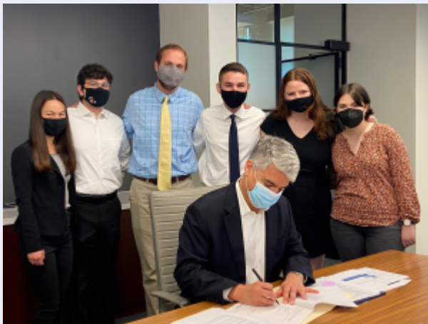
President Fenves signing climate commitments with student leaders

These sessions are a key part of the University continuing progress toward pre-existing greenhouse gas (GHG) emissions reduction goals - 50% by 2030 and reaching net zero emissions by 2050, using a 2010 baseline - and upholding new commitments made by signing Second Nature's Climate Commitment and by joining the United Nation's Race to Zero campaign . Sign up to join a conversation using this registration link .